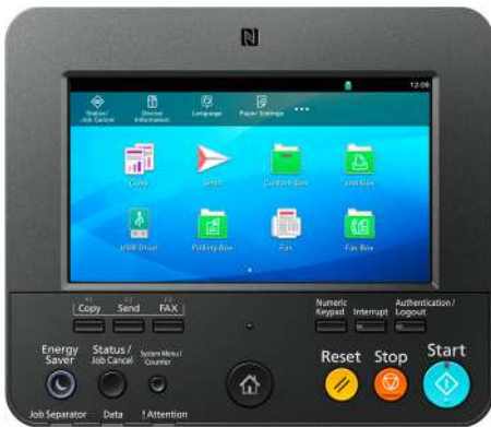
TASKalfa 508ci / 408ci / 358ci control panel