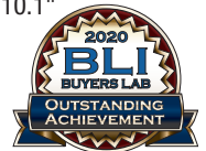
Sharp Synappx Family Innovation Award

The new MX-7081/8081 high-speed color document systems feature the latest 10.1" (diagonally measured) high-resolution touchscreen with signature retractable keyboard for unmatched ease-of-use. Using the latest touchless technology, you can operate these models by simple voice commands with Amazon Alexa on the MFP, and print release, copy and scan jobs with Synappx™ Go on your personal device.