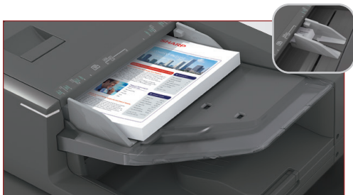
High capacity 300-sheet DSPF with 150-business card feeder for increased efficiency and scanning capabilities.