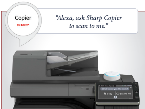
MX-8081 shown with available Sharp MFP Voice feature with Amazon Alexa.