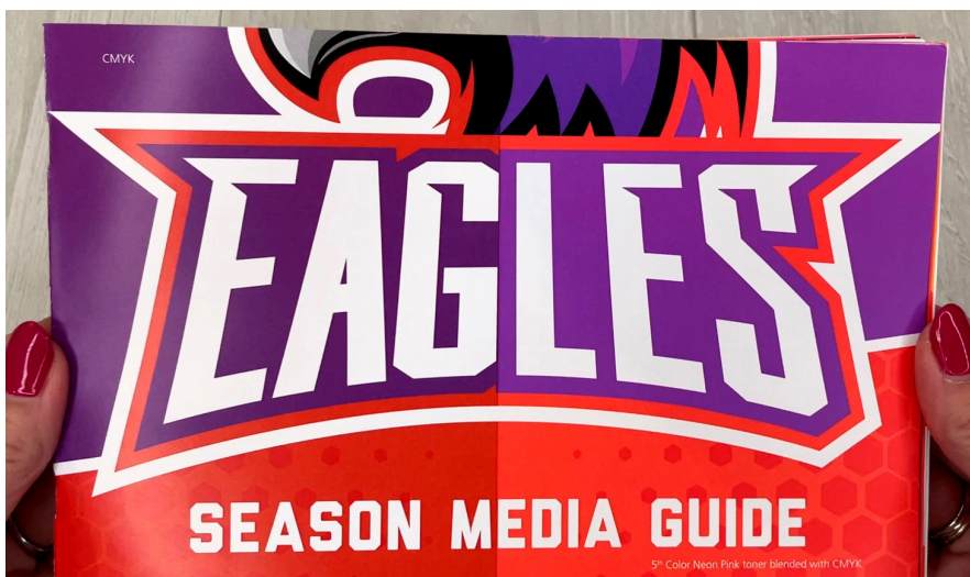
5 th Color Neon Pink toner blended with CMYK